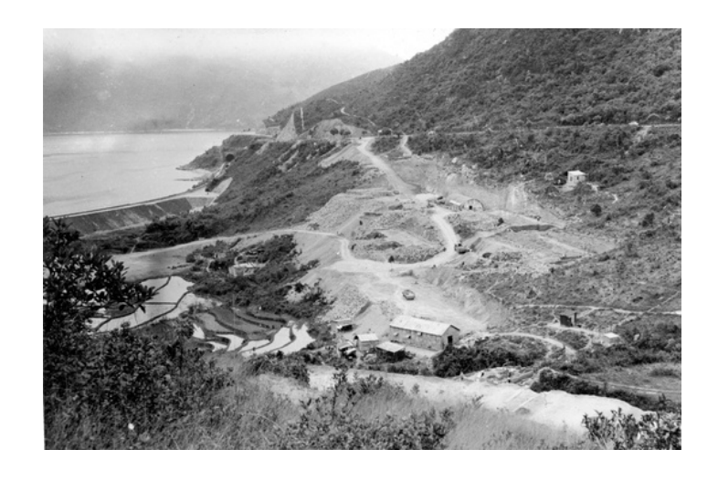
1951 Chung Chi College was founded with 63 students and about 10 teachers.